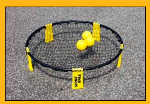
SPIKE BALL DAILY - $4 | WEEKEND - $8