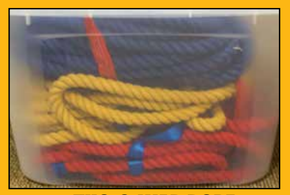
TUG-O-WAR ROPE 50' | 75' | 100' DAILY - $3 | WEEKEND - $6