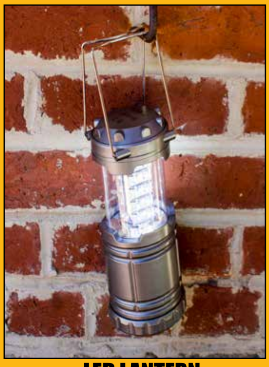
LED LANTERN DAILY - $3 | WEEKEND - $6