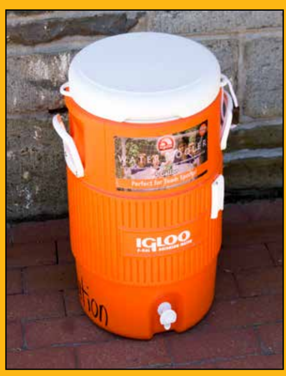
5-GALLON WATER COOLER DAILY - $3 | WEEKEND - $6