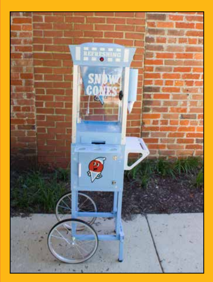
SNOW CONE MACHINE DAILY - $30 | WEEKEND - $40