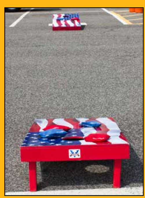
CORN HOLE DAILY - $4 | WEEKEND - $8

PLEASE CLEAN MACHINES BEFORE RETURNING PRICES ARE SUBJECT TO CHANGE