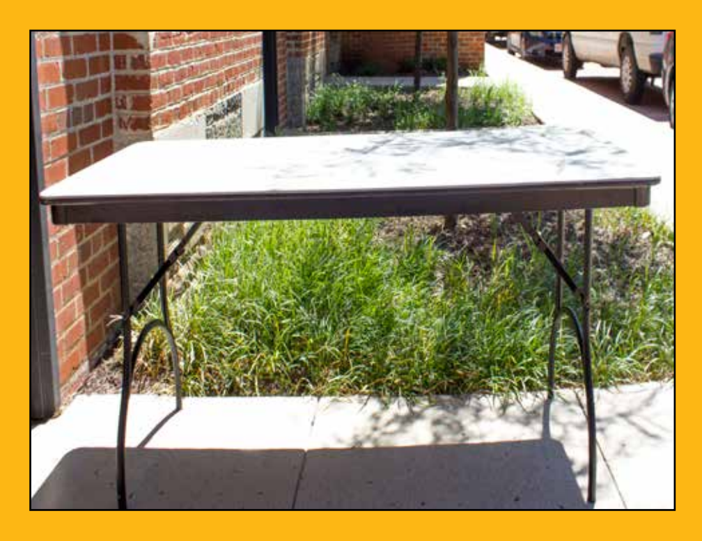
TABLE & CHARR RENTALS