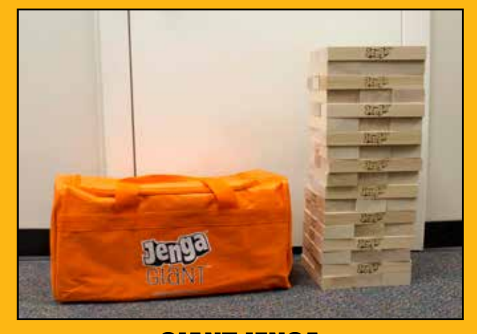
GIANT JENGA DAILY - $3.50 | WEEKEND - $7.00