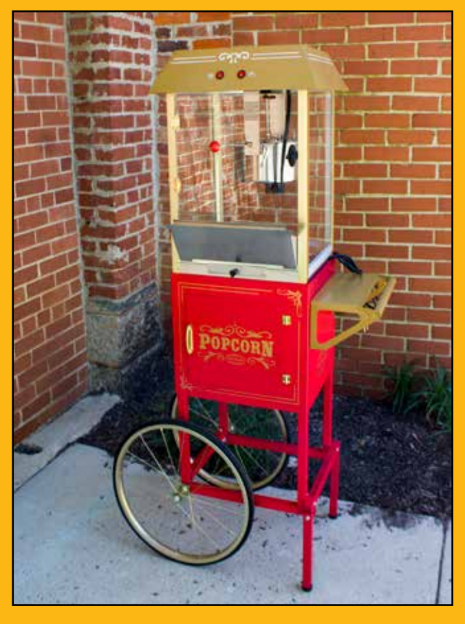
POPCORN MACHINE DAILY - $30 | WEEKEND - $40