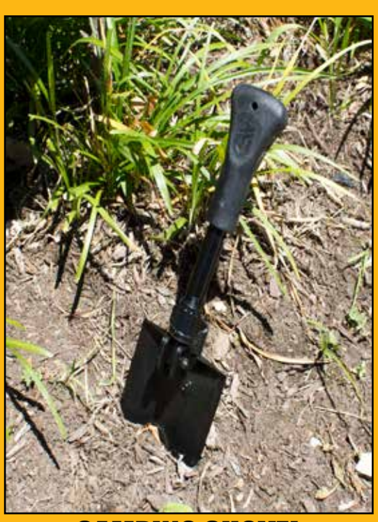
CAMPING SHOVEL DAILY - $2 | WEEKEND - $4