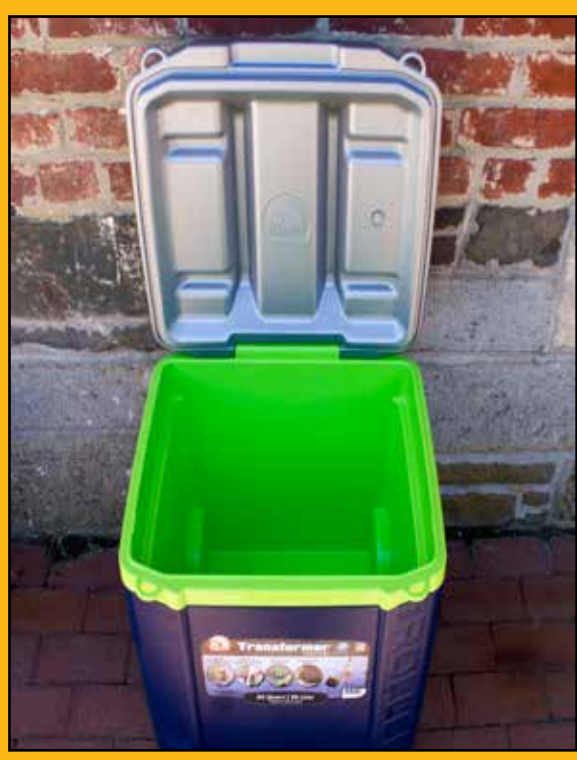
56 QUART ICE CHEST COOLER DAILY - $5 | WEEKEND - $10

PLEASE WASH COOLERS BEFORE RETURNING PRICES ARE SUBJECT TO CHANGE