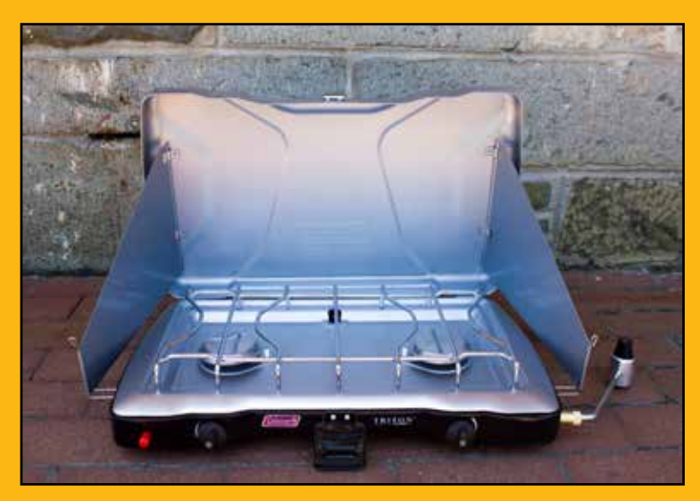
2-BURNER CAMPING STOVE DAILY - $9 | WEEKEND - $18