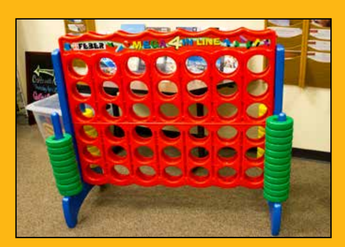
GIANT CONNECT 4 DAILY - $4 | WEEKEND - $8

PLEASE CLEAN MACHINES BEFORE RETURNING PRICES ARE SUBJECT TO CHANGE